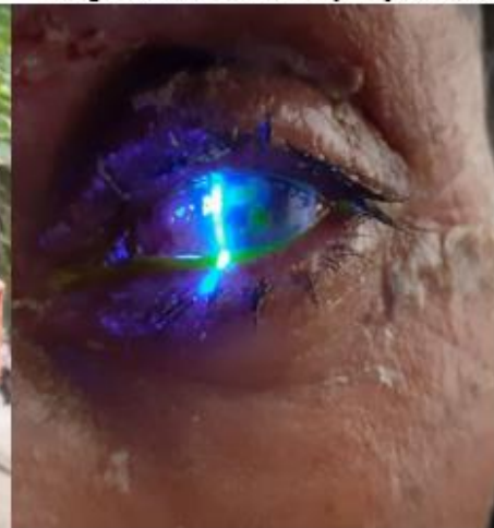
Image 4: Fluroscein stain positive epithelial defect present at 5 O clock position around 1mm in diameter