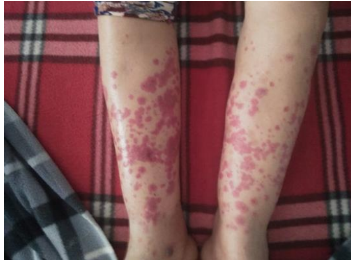
Fig 1: A physical examination revealed a purpuric rash over the entire surface of both legs.

The fever subsided after 48 hours of antibiotics and laboratory results showed a gradual improvement in leukocytosis and the level of reactive protein C. She was released and was to be followed on an outpatient basis.