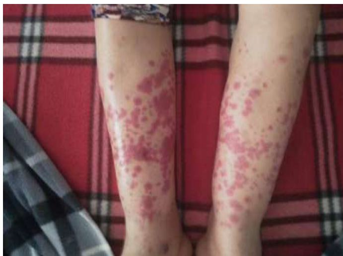
Fig 1: A physical examination revealed a purpuric rash over the entire surface of both legs.

The fever subsided after 48 hours of antibiotics and laboratory results showed a gradual improvement in leukocytosis and the level of reactive protein C. She was released and was to be followed on an outpatient basis.